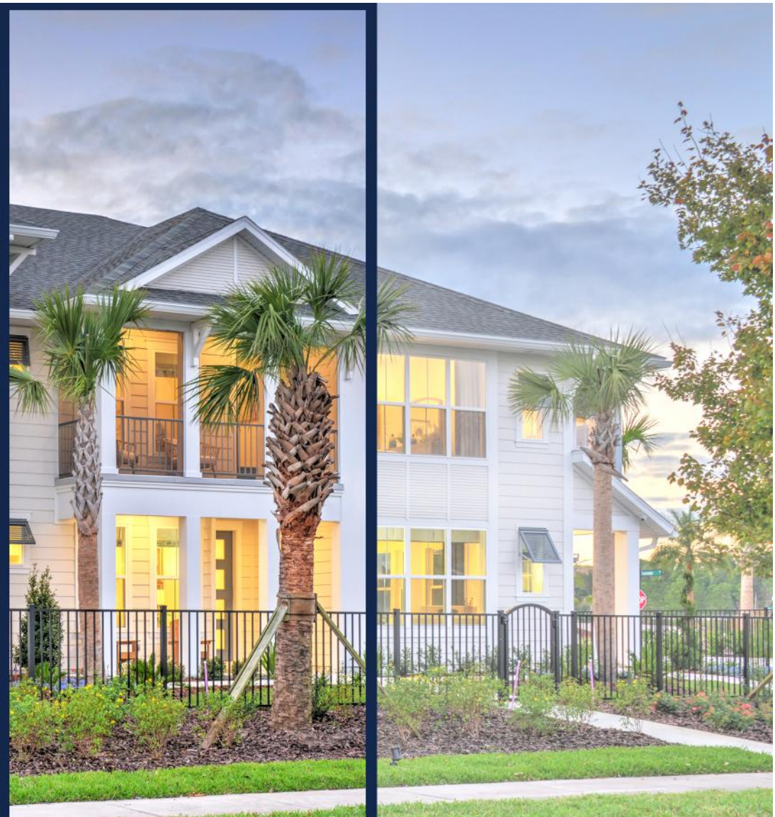
THE CASTILLO - WEST INDIES