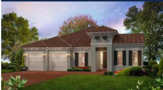
THE WEST INDIES - CONSERVATORY

Living Area: 2,588 ft 2 Under Roof: 3,462 ft 2